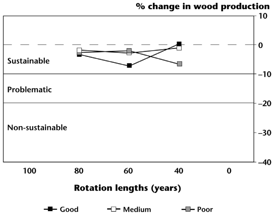
FIGURE 3. The effect of rotation length on the relative change in stemwood production from the first rotation (represented by the dashed line) to the last rotation of the 240-year simulation period for poor-, medium-, and good-quality sites. Solid lines represent the boundaries of the sustainability categories.

wood production (the analogue for Measure 6.1) over subsequent rotations (Figure 3). Even though soil organic matter and site N capital showed significant declines at shorter rotations, model results indicate that sufficient nutrients were still available to sustain wood production at a constant level; however, the reduction in SOM and site N capital under shorter rotations will likely translate into a decrease in ecosystem resiliency. If reserves of SOM and N capital are depleted through management practices, these ecosystems will be less able to absorb further disturbance (either from natural process or harvesting). In this event, reduced productivity (as reflected in measure 6.1) will be a likely outcome.