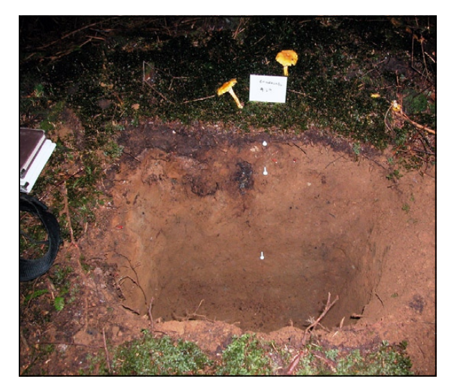
FIGURE 2. Typical soil pit from productive mushroom sites in Haida Gwaii.

Forest cruise plots were done at each site to determine stand characteristics (BC Ministry of Forests 2000). A full prism sweep was made at plot centre, and the diameter at breast height (DBH) was noted for each "in" tree. One or two co-dominant trees of hybrid Sitka