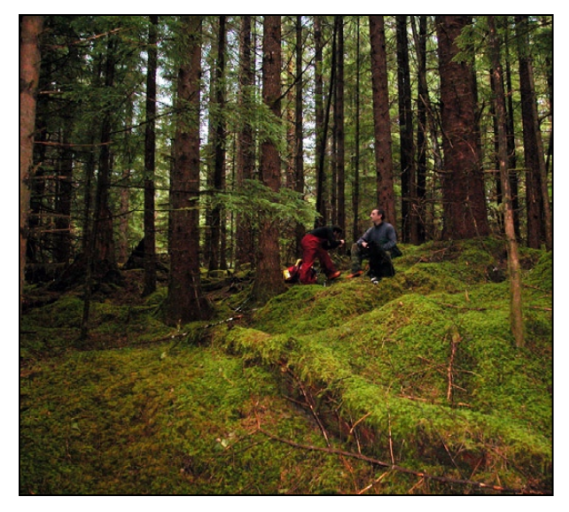
FIGURE 3. Typical stand and vegetation community for productive mushroom sites in Haida Gwaii.

A total of 231 polygons were mapped as CWHwh1/01 ecosystems within the project area surrounding Skidegate Lake. Some of these stands were adjoined but labelled as separate polygons because of significant