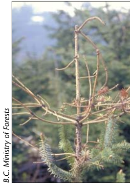
B.C. Ministry of Forests