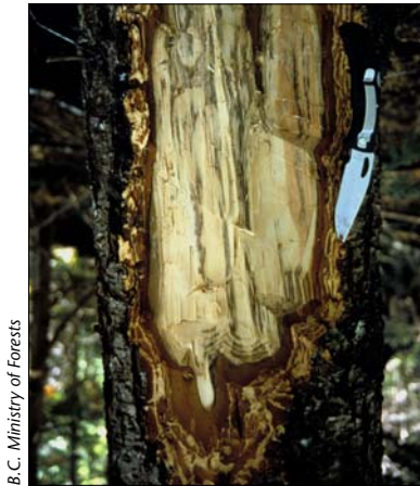
B.C. Ministry of Forests