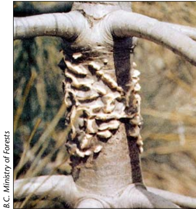
B.C. Ministry of Forests