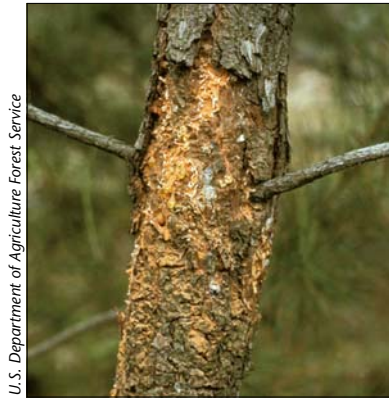
U.S. Department of Agriculture Forest Service