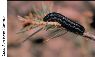
Canadian Forest Service