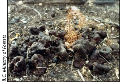
B.C. Ministry of Forests