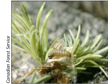
Canadian Forest Service