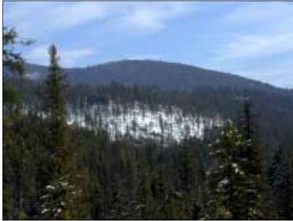
FIGURE 3A. Example of partial cutting approach using a shelterwood concept.