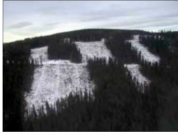
FIGURE 3B. Example of partial cutting approach using a checkerboard pattern of removal.

visual resources and public perceptions in this district (B.C. Ministry of Forests 1994a, 1994b), it is surprising that, up until January, 2001 11 , no VQOs were established (D. Fitchett, Recreation/Range Officer, B.C. Ministry of Forests, pers. comm., 1999). One possible explanation for this is that, given the uncertainties inherent in British Columbia's forest sector, managers want to maintain as much flexibility as possible, and therefore avoid establishing VQOs, which are binding once established. This may result in low levels of visual protection "on the books," but higher levels of visual resource management on the ground. Clearly, district managers have many of the legal mechanisms to bypass VQOs, but it is not clear whether they feel comfortable without VQOs as guidelines, or whether they will realize the timber availability gains expected. Community perceptions may actually constrain timber supplies and availability, even if official VQOs are relaxed or eliminated. It is often assumed that VQOs are used as a de facto indicator of public acceptance of forest management (Sheppard 2000). However, if public pressures are more constraining than the established VQOs themselves, the influence of visual resource management regimes on timber availability is effectively eliminated since the most restrictive constraint determines what management will prevail. It is also possible that differences in the degree of visual constraint between