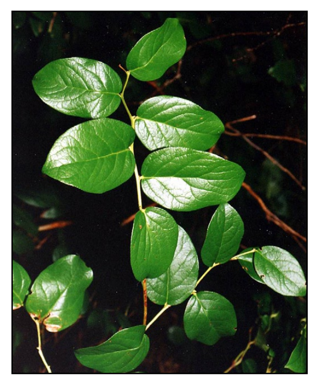
FIGURE 2. Salal (Gaultheria shallon).